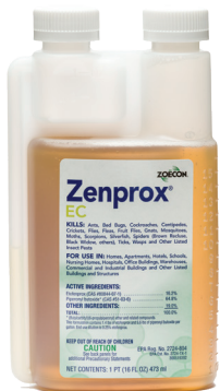
Zenprox® EC Insecticide