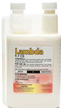
Lambda 9.7 CS Insecticide