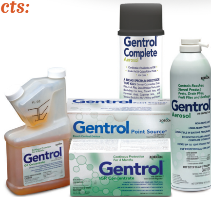
Gentrol® Family - Aerosols, Concentrate, and Point Source Synthetic insect growth regulators