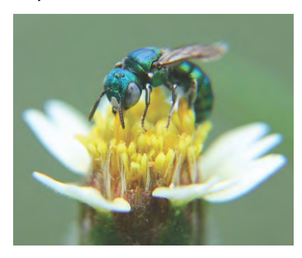
A small carpenter bee (Caertina)

Ceratina (small carpenter bees) are distinctly different from large carpenter bees and bumble bees, and excavate tunnels in pithy stems of various bushes. They are not usually of economic importance.